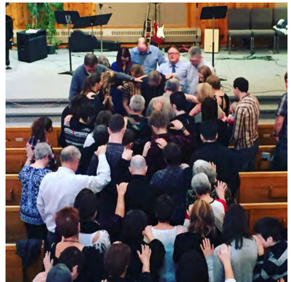
Prayer circle in Paradise Valley