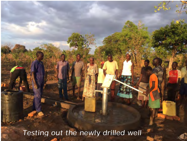
Testing out the newly drilled well

Three wells were drilled in the northern district of Pader from a private donation. There is nothing quite like clean drinking water that is accessible. Many of the community that were previously in internally displaced camps can now enjoy this generous and vital gift.