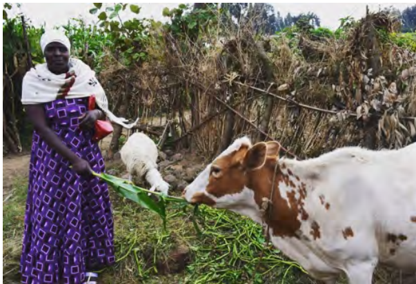
Being presented with a cow

We have entered 2017 with a burst of activity, which is not new to us, but it certainly makes the time fly.